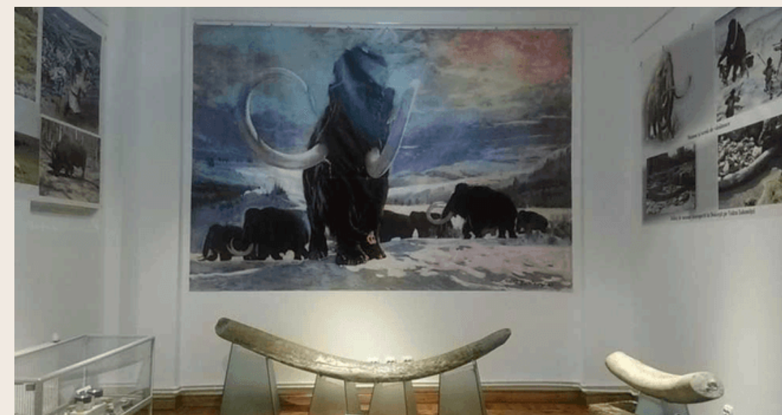
Museum of Evolution in the Paleolithic