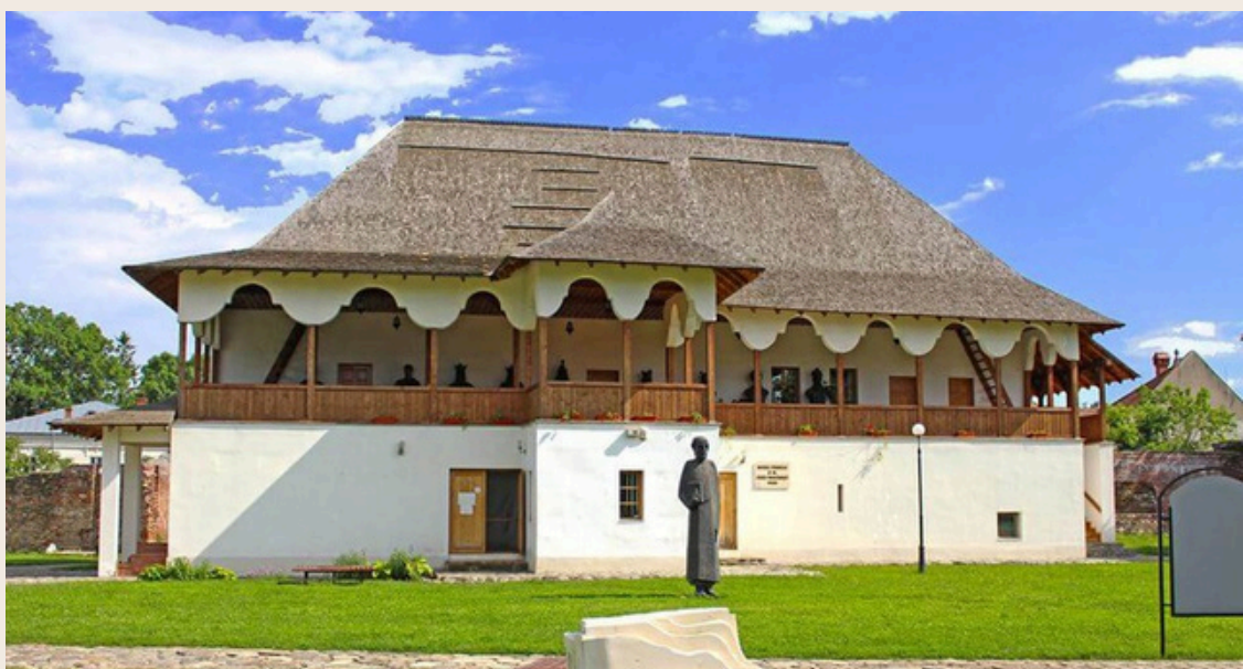
Printing & Old Book Museum